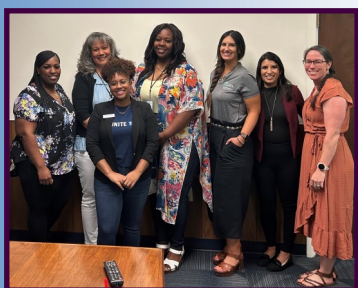
Meet & Share with Lubbock Public Health Department

NOTE: We will be reaching out soon to community friends who have said they want to join LBK Community and the Unite Texas networks. We cannot wait! :-)