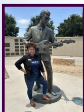
And... she met a guy ;-)