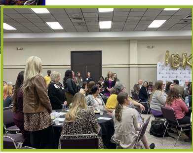
Above: LBK Partners being recognized