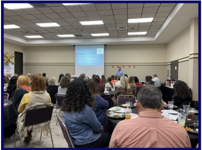
Above: What a great turnout and time together!

LBK Community Key Words: Navigation Coordination Collaboration Partnership SDoH Needs/Referrals