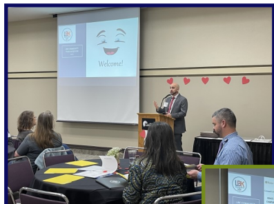
Below: "That table" (you had to be there :-))