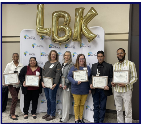
2022 Partner Recognition (L to R): LIFE, Inc., Catholic Charities: Kinship Navigation Program, Broadway Church of Christ, Citibus, Covenant Health, Grace Manor/Children's Hope, and Lubbock Boys & Girls Club