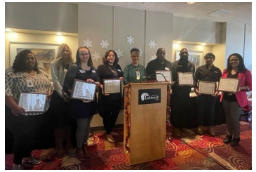
Partners in attendance (L to R): S.U.S.A.N, UMC, YWCA, EL ROBI, Guadalupe-Parkway Center, SPFB, Hub City Outreach Center

They saw a need, began to dream, some fate intervened, and they moved forward: LBK Community Network was established on June 3, 2020.