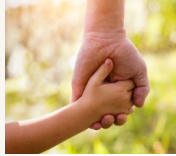
Oct21-Oct27 National Adoption Week