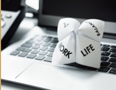
Oct7-Oct 13 National Work Life Week