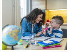
Oct 1- Oct 31 ADHD Awareness Month