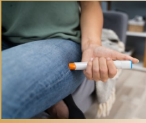
Oct 1-Oct 6 Anaphylaxis Awareness week

October is packed with numerous awareness days focusing on important issues that impact our health and well-being. Below are a few awareness days I'd like to bring to your attention.