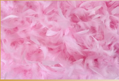
Oct-18 Wear It Pink Day (Breast Cancer)