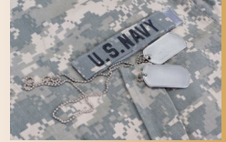
Oct-27 Navy Day (US)

*** Images and information is from Awareness Days, https://www.awarenessdays.com