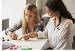
Oct-10 World Dyslexia Awareness Day