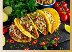
Oct. 4 National Taco Day